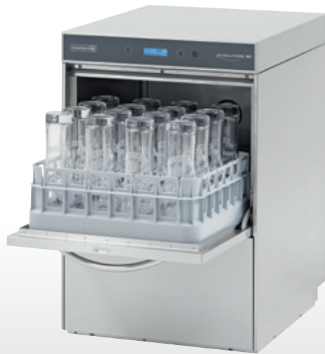
401 &amp; 405 WS