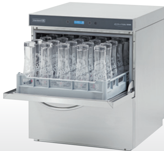
501 &amp; 505 WS